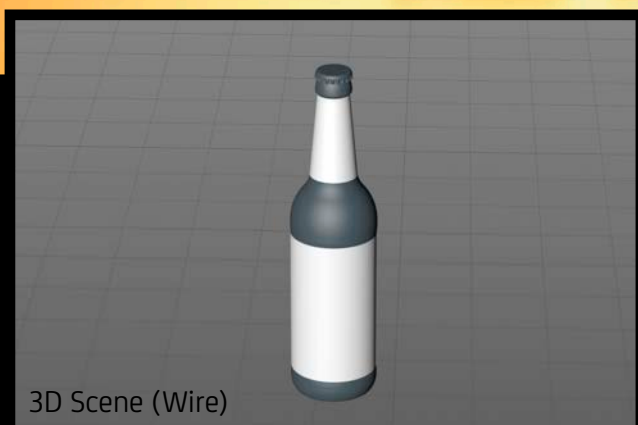
3D Scene (Wire)