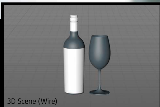
3D Scene (Wire)

Note: you should have Octane Render 3.x get installed to render Cinema 4D scene file