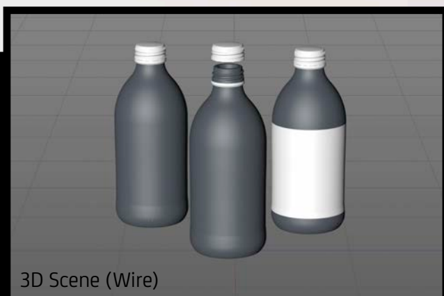
3D Scene (Wire)