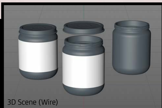
3D Scene (Wire)