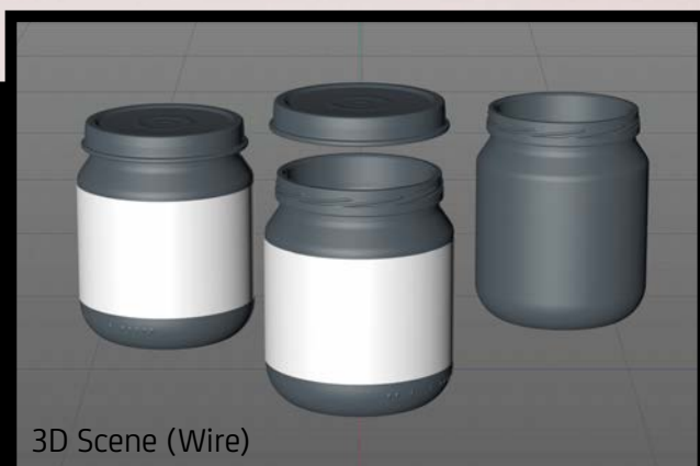
3D Scene (Wire)