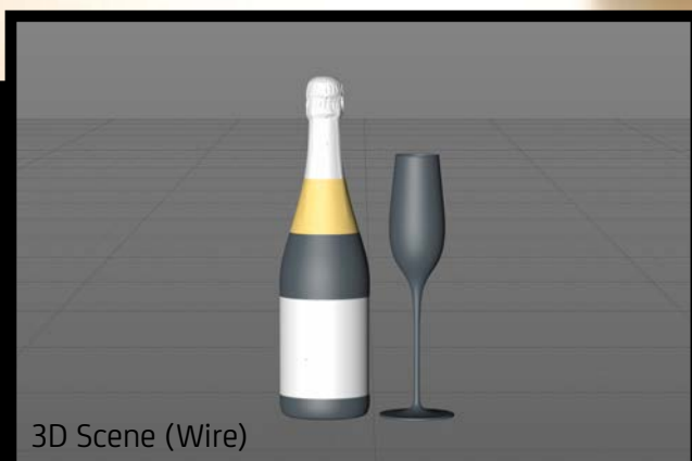
3D Scene (Wire)