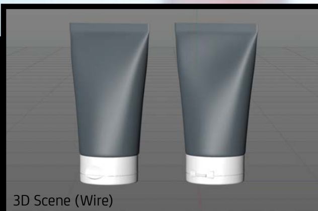
3D Scene (Wire)

Note: you should have Octane Render 3.x get installed to render Cinema 4D scene file