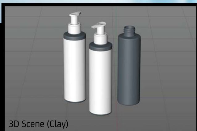
3D Scene (Clay)