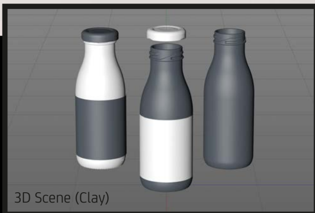
3D Scene (Clay)